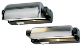
1854, UL certified