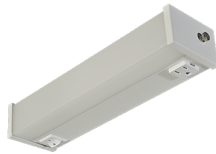
GB2, UL certified