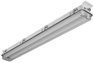
GXPN, UL certified