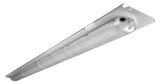
MIR KIT LED