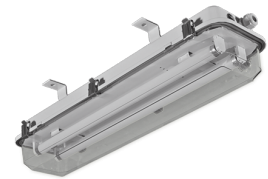
1444, UL certified